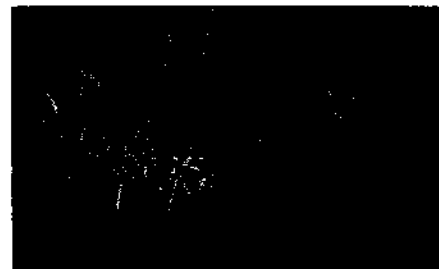
A tropical rainforest grasshopper.

What do these observations reveal about the effects of latitude? One of the best established truths in ecology is that most groups of organisms are more diverse in tropical than in temperate ecosystems (8). Given the greater species diversity in the tropics, one might suppose that there are also more opportunities for biotic interactions. Indeed, a compilation of many independent studies supports the supposition that there are greater opportunities for plants and herbivores to interact in the tropics (9). On average, tropical plants invest more in chemical and physical defenses, suggesting that, over evolutionary time,