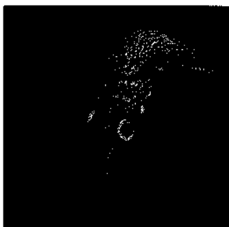
A Lepidopteran caterpillar with warning eyespots.

It is perhaps tempting to extrapolate from these patterns to predict changes in plant-animal interactions caused by the current global warming trend. Such extrapolations may be misguided, however, because the rates of climate change today are several